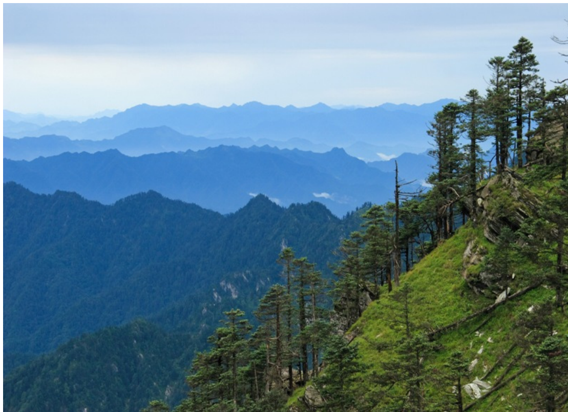
Tangjiahe Nature Reserve (CN189) is a Giant Panda Ailuropoda melanoleuca reserve at the edge of the Sichuan basin.

IMPORTANCE TO OTHER FAUNA AND FLORA: Nationally protected plants include Davidia involucrate , Tetracentron sinense and Cathaya argyrophylla . Animals include Panthera tigris amoyensis , Panthera pardus , Neofelis nebulosa , Presbytis francoisi , Macaca mulatta , Manis pentadactyla , Viverra zibetha and Viverricula indica .