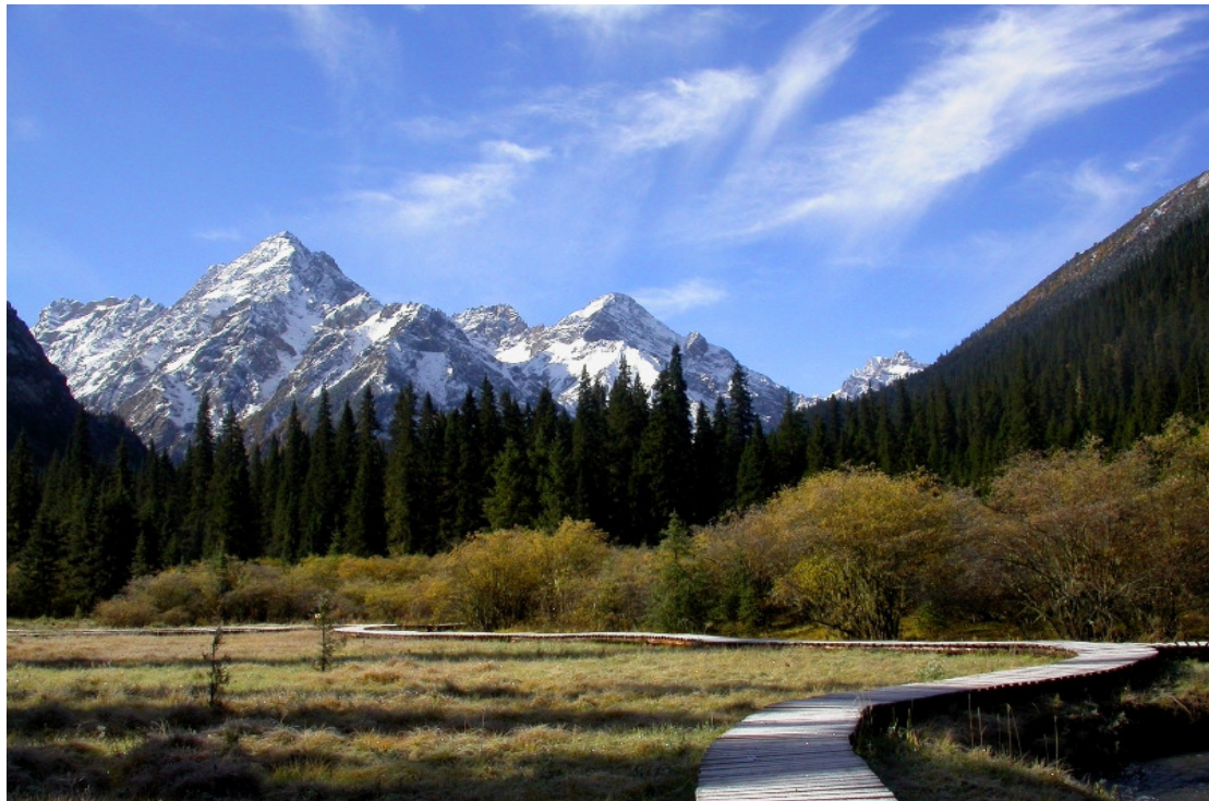
Wanglang (CN186) was established as a nature reserve in the 1960s for the protection of Giant Panda Ailuropoda melanoleuca , and also protects many rare montane bird species.

Key: ● = Protected; ○ = Partially protected; ○ = Unprotected.